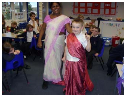
Trying on a sari!