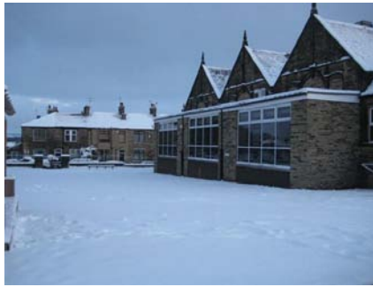
Calverley Parkside in the snow.