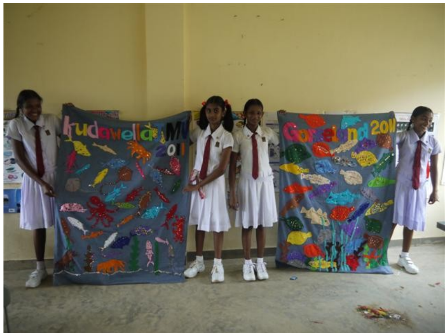
Bright and colourful water collages created by the children at Gorseland Primary and Kudawella School.