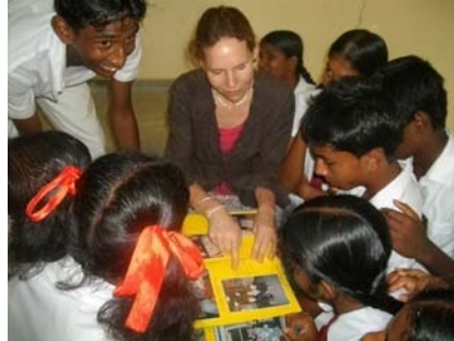
Looking at the 'Water' project

Entering the first classroom a song was requested and there was no standing back from then on. We had great fun with grade 1 and Head, Shoulders, Knees and Toes. The Dance teacher had us bare foot dancing and playing the drums with Grade 4 and some older children.