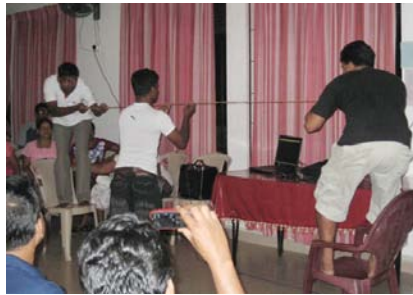
Batti teachers perform an hilariously dangerous act involving a tight rope!!

For the second evenings entertainment a talent show had been organized. The teachers, who were allocated just 3 and a half minutes per act, were both creative and enthusiastic. In all 23 acts were presented and were incredibly diverse! We had singers, mime acts, comedy sketches, dances, dramas and even a flutist. Once again it was great to see the Southern and Eastern teachers embracing each others cultures and collaborating on acts. The fun continued with certificates and small prizes being awarded! These included the 'bringing Ally to tears' award and 'the most dangerous act' award.