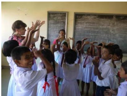
Singing the action song Head, Shoulders, Knees and Toes!

From the moment we arrived we were greeted with flowers, Betel Leaves, smiles and warm words and performances at the wonderful welcoming ceremony. A tour of the school introduced us to teachers and children.