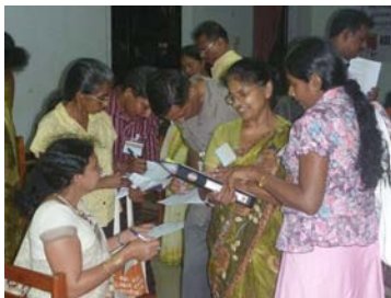
Teachers enjoy networking session

The teachers were then immersed in a networking task which encouraged them to mingle with, talk to and get information from their fellow teachers. This valuable exercise meant that at the end of the session they had compiled a useful list of new contacts and information on how other schools were managing and developing their global partnerships.