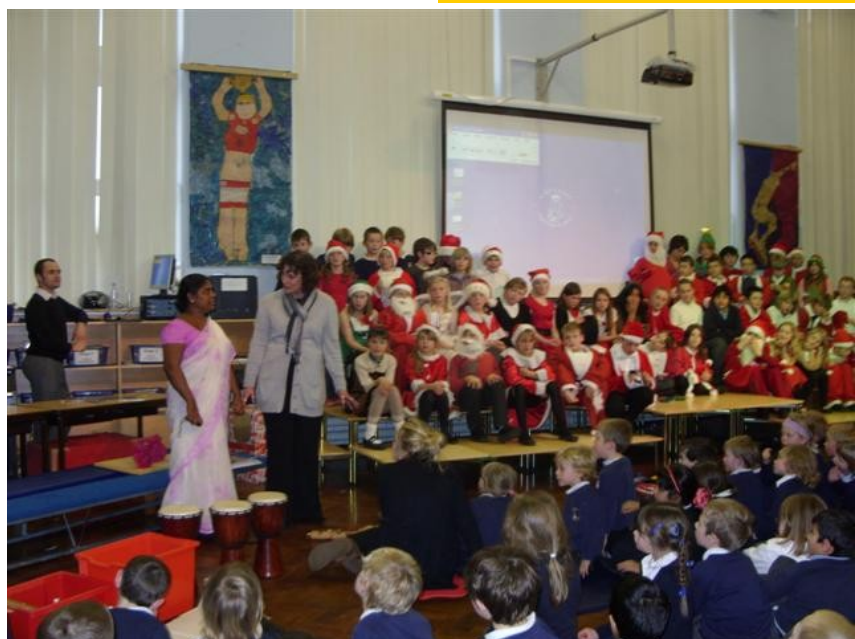
Saying 'goodbye' at the end of a busy week

Thank you to DFID for providing funds through the British Council, Reciprocal Visits Grant.