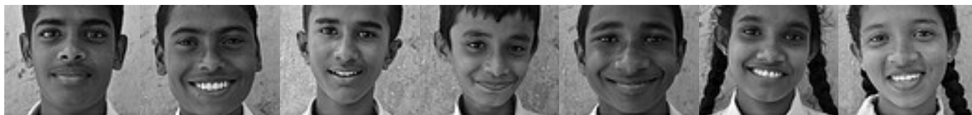
Portraits of some of the Snap Lanka Photographers