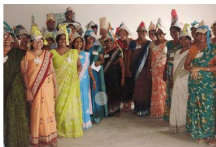
Learning 'The Silly Hat Store' song!

The teachers were split into groups and took part in a range of activities which they then reported back to the others. Mary had selected only low or no-cost activities that could easily be taken back to their own classrooms. Teachers took time out to learn an English Action Song!