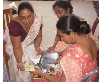
One activity involved teachers guiding their blindfolded partners around an obstacle course and another finding answers in books!

There were also additional workshops held during this successful workshop calendar, including one for the 10 teachers from the Eastern Province who were invited to attend our inaugural conference (Pages 5 & 6). Feedback gathered so far suggests that this years calendar has been highly appreciated by the teachers and our evaluation is that this has been our best year so far!