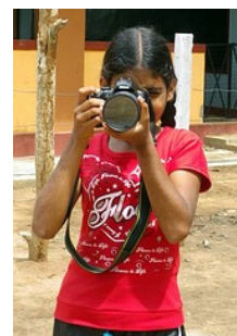
"I have touched a camera for the first time in life, I am very happy"

Stay tuned for our next newsletter which will include a large feature on the Snap Lanka Project! For further information on how you can support future Snap Lanka Projects please contact adoptsrilanka@gmail.com