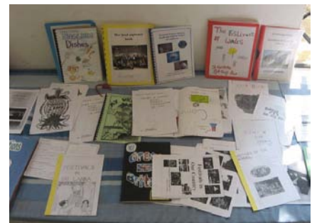
Just a few of the projects exchanged!