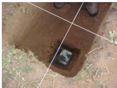
Ceremonial Foundation Stone

ASL is dedicated to supporting education projects and it is in this spirit that land in Rekewa was purchased for the Turtle Conservation Project. Work is now well underway to construct an eco-friendly education and research centre for turtle conservation in Sri Lanka.