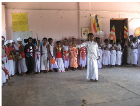
Children performing at the concert

off their children's talents. These included singing, dancing and welcome speeches.