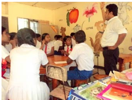
The first meeting of the TWINS Global Club

needs. Other non English speaking teachers are also keen to observe and facilitate when needed and depending on the project topic.