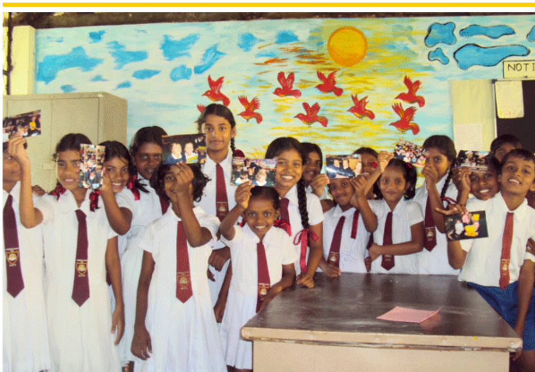
Children at Puwakdandawa Primary are very happy to see photos of their project with their UK friends at Lethbridge Primary School, Swindon.