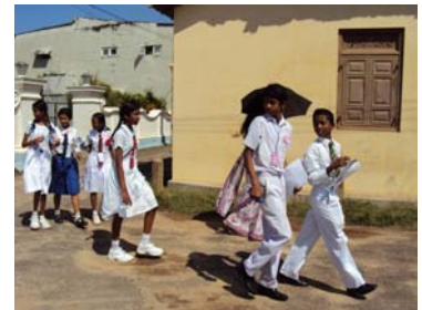
Scavenger hunt in the Fort during the 2010 Festival's 'Schools' Day'

In 2010, for the first time, the Festival with the assistance of ASL TWINS, ran a day of activities for schools at the start of the Festival. This special event involved over 100 students from selected Galle Schools. The program, developed with their interests and language levels in mind, included a historical scavenger hunt through the Fort and sessions with visiting writers. This was an inspiring and unusual opportunity for schoolchildren to truly have an international literary festival come to their region and address their interests. Schools' Day will take place again following the 2011 Galle Literary Festival.