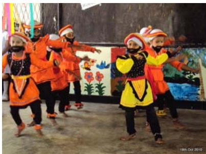
The traditional 'Waliga Patuna' dance

After, a small cultural show was held in the room for the guests to show the children's talents. They performed English action songs, traditional dance and made thanking speeches in English while there school friends and some parents watched from outside.