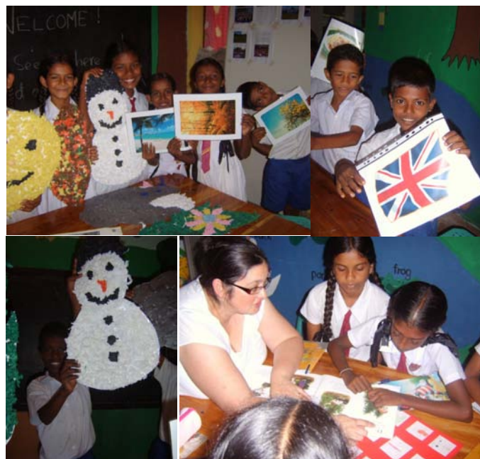
Children proudly show the project work brought for them from the UK

Thank you to DFID for providing funds through the BC Reciprocal Visits Grant.