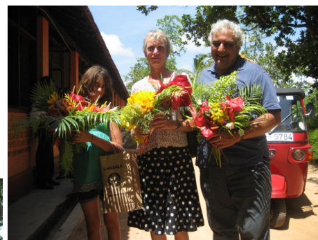
The family ready to leave after spending a couple of hours at the school.

The partnership between the schools began in July this year so it is wonderful for Hinidumgoda School to receive a visit on behalf of their TWINS school so soon. This personal contact can only help the partnership develop well in the future.