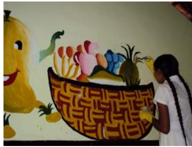
Secondary student gives a helping hand

bright English focused murals on the walls. Puwakdandawa is TWINNED with Lethbridge Primary School, Swindon, UK.