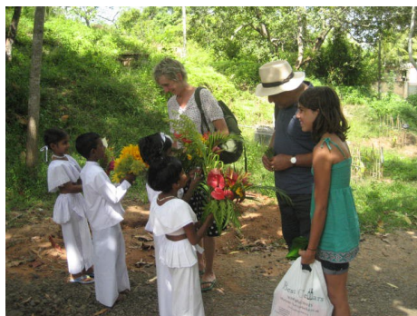
Flowers for the visitors

After meeting the Principal they were taken to the main hall where the English Unit had organized a mini concert to show