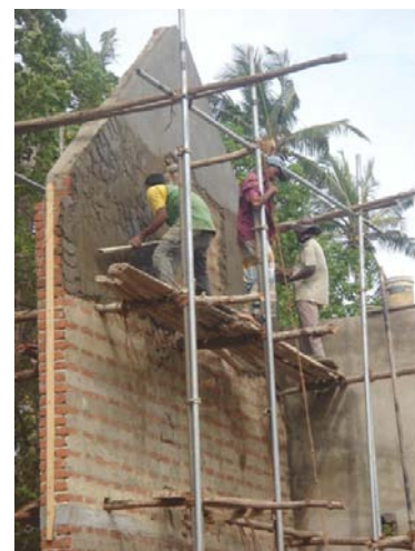
The new centre taking shape thanks to the hard work of the labourers.

Local and international tourists as well as touring school groups will soon be visiting the centre to participate in night watching for turtles as well as learning first hand from local guides the importance of conserving Sri Lanka's unique fauna and flora.