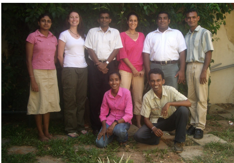
TWINS Team Members from Back Left: