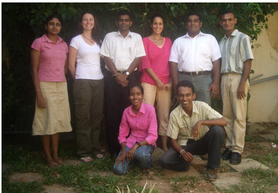
TWINS Team Members from Back Left: